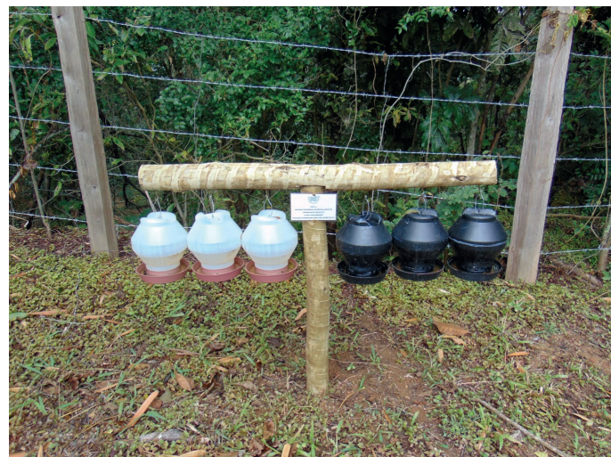
Figure 2. Trap for Aedes aegypti placed in collection points in the experimental Campus in Universidade de Vassouras.

The larvae capture site was previously prepared using traps of 1 L of water and 1 g of organic matter (1:1), at room temperature, as an attractant for female oviposition.