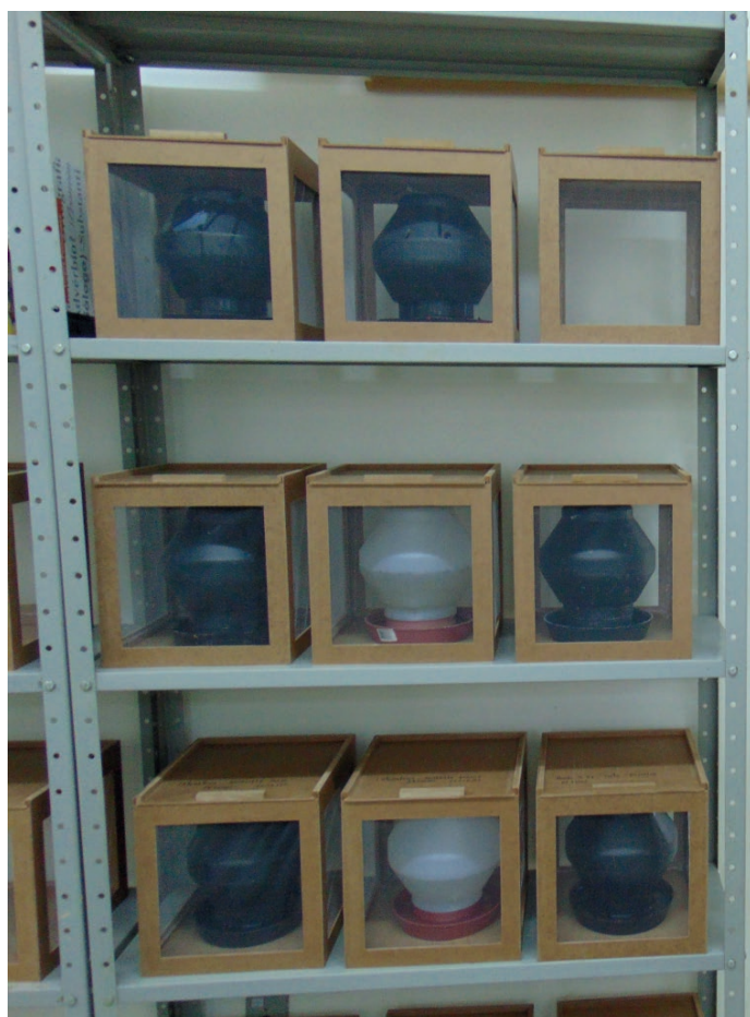
Figure 3. Cages for observation and maintenance of Aedes aegypti (Diptera: Culicidae). Laboratório de Insetos Vetores (LIV), Universidade de Vassouras, RJ.

The traps were then taken to the laboratory, labeled according to the collection points, for analysis of the results.