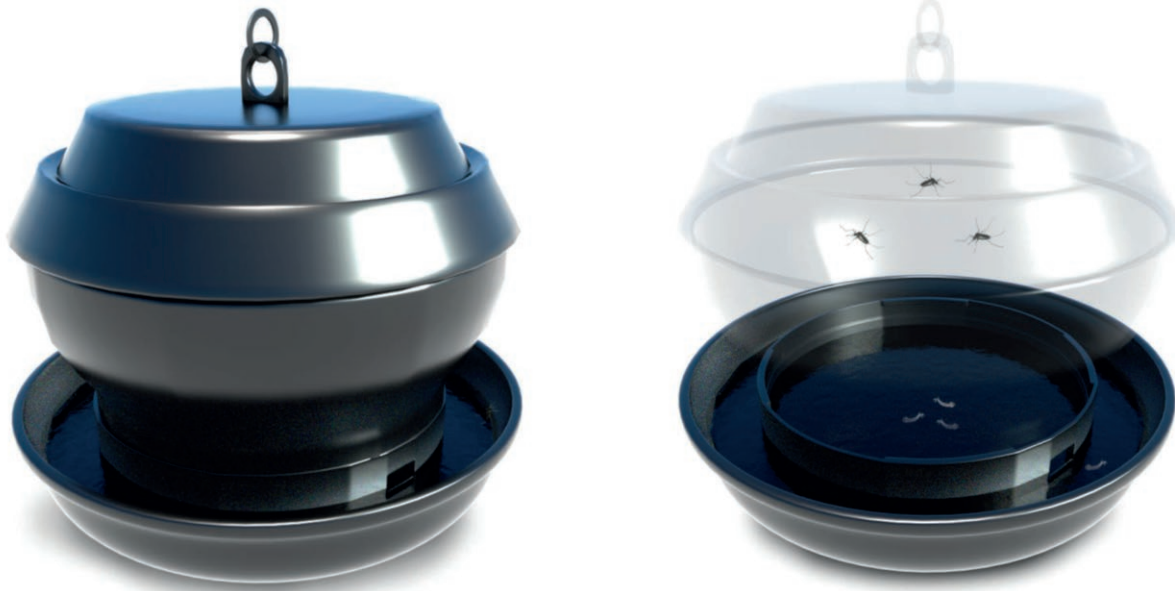
Figure 6. Mosquitex trap.

all kinds of entomological methods, it can be traps for eggs, larvae, or adults, although ovitraps that are a simple trap for collecting Ae. aegypti eggs (Fay & Eliason 1966) have proven to be an efficient trap model when it comes to monitoring infestations, standing superior to larvae research for this purpose. Marques et al. (1993) demonstrated the superiority of ovitraps over larvitrap. This is also highlighted in the study carried out by Gama et al. (2007) regarding traps to capture the adult mosquito.