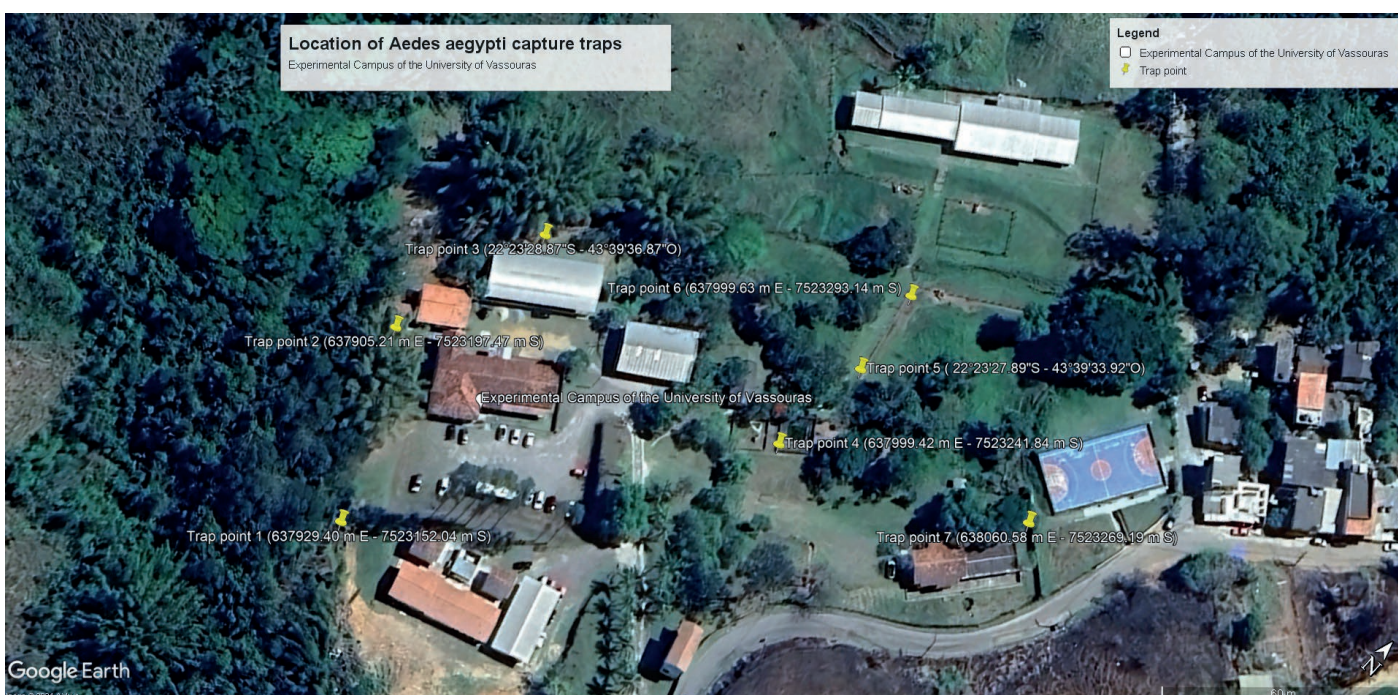
Figure 1. The collection area was marked with the geographical coordinates of Vassouras, Rio de Janeiro, RJ.

Mosquito entrapment tests using prototypes of positive "larvitrap" traps. The cages for the traps were assembled (Figure 3), with light wooden structures (Eucatex type), which were made in the shape of a cube measuring 0.25 x 0.25 x 0.26 m, using wood to join the vertices, leaving the sides of the cube open and covered with fine white mesh (mosquito