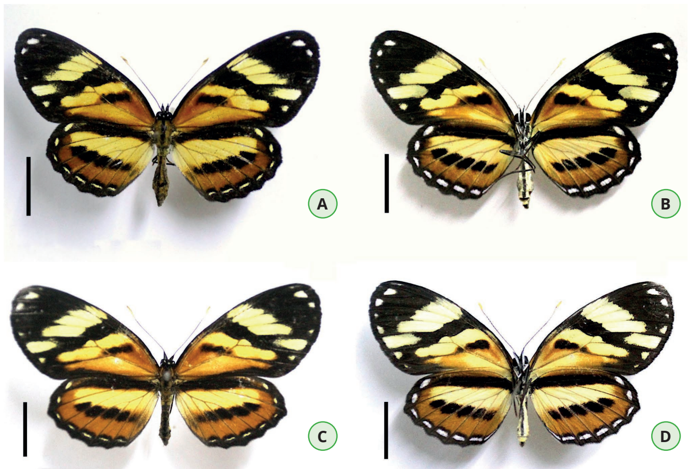
Figure 2. Eresia erysice erysice . Female: A. Dorsal view. B. Ventral view. Male: C. Dorsal view. D. Ventral view. The scale bar indicates 2 cm.

GVV: Taxonomic identification, first draft, and final writing. JHCD: Revision and final writing of the article.