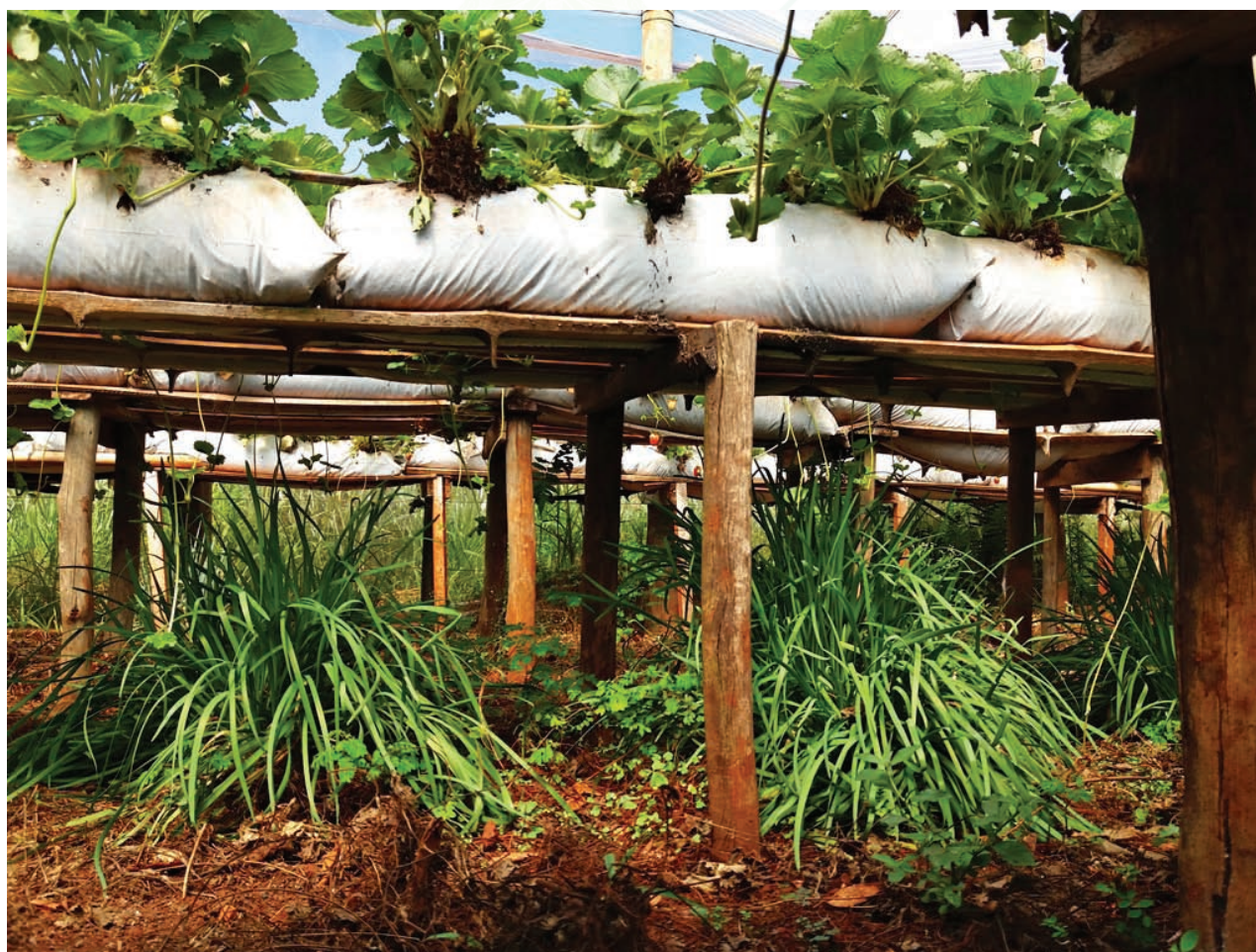
Figure 1. Chinese chive cultivated as undercrop in a high-tunnel strawberry (Albion cv.) production.

Treatments were replicated eight times in completely randomized design. The cumulative effect of the mite feeding was evaluated by a cumulative number of mites per day (CMD) index. This formula is recommended to compare the accumulated treatment effects (COSTELLO 2011). CMD index was calculated with the