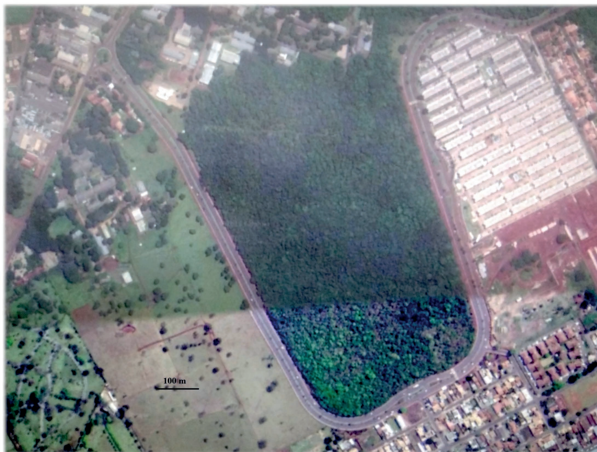
Figure 1. Photo (satellite) Private Reserve of Natural Heritage of the Universidade Federal de Mato Grosso do Sul (RPPN-UFMS).