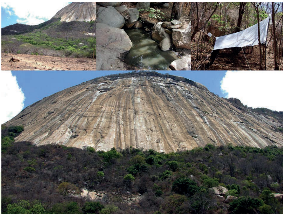
Figure 1. Collection area at the time of installation of Malaise traps, Serra do Lima, Patu, Rio Grande do Norte, 2008.

In all, 37 families were captured at the studied areas, 30 of them in both localities. Eucharitidae, Leucospidae, Sclerogibbidae, Proctotrupidae, Rhopalosomatidae and Pergidae were collected only in Mossoró and Sphecidae only in Patu.