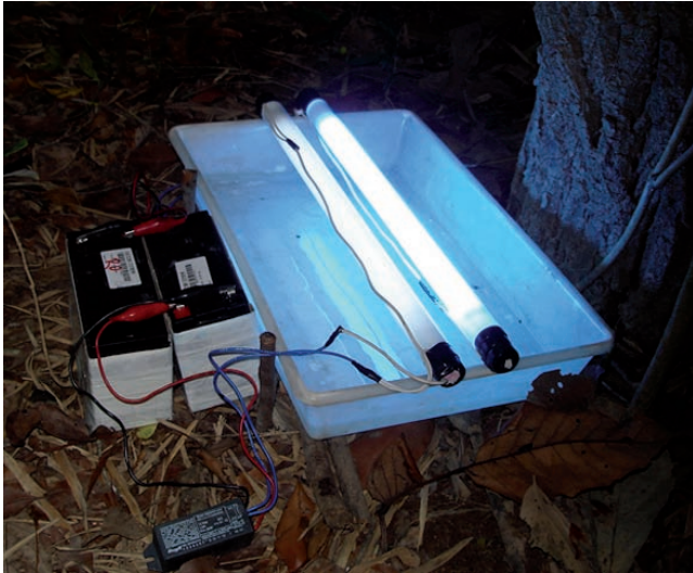
Figure 1. Light pan trap, the components of trap.

scales in alcohol, but some to a lesser extent than their sister order Trichoptera).