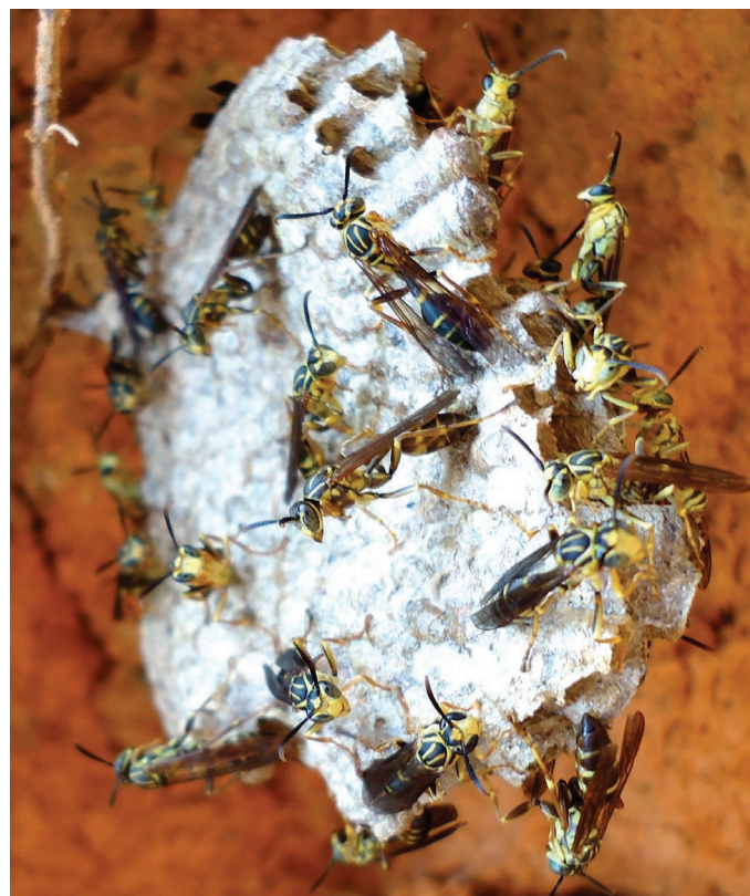
Figure 2. Nests of the wasp Mischocyttarus consimilis Zikán in the municipality of São Gonçalo do Sapucaí, Minas Gerais.