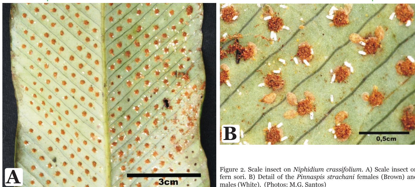
Figure 2. Scale insect on Niphidium crassifolium . A) Scale insect on fern sori. B) Detail of the Pinnaspis strachani females (Brown) and males (White).