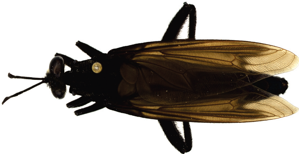
Figure 1. Dorsal habitus of Protomydas coerulescens .