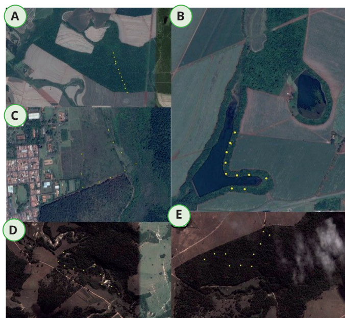
Figure 1. Distribution map of the collection areas in the São Paulo State and the sampled spots in each phytophysiognomy. The yellow marking represents the distance between sampling points (100 m) and where each trap was set.

The bait-trap distribution was done by the following procedure: ten points, distanced 100 m from each other, were marked using plastic tape tied to trees, thus reducing the chance of pseudoreplication by collection of a single wasp population in different sampling unities. At each point, five traps with a height of 1.5 m from ground and five other traps at canopy level (around 5-9 m) were set. The traps were made with 2 L plastic bottles (Souza et al. 2015). At each bottle, four circular holes were done and 200 ml of concentrated passion fruit juice were added to be used as bait. The specimens were collected with a sieve and tweezers and fixed in 70% alcohol recipients of the universal collector type.