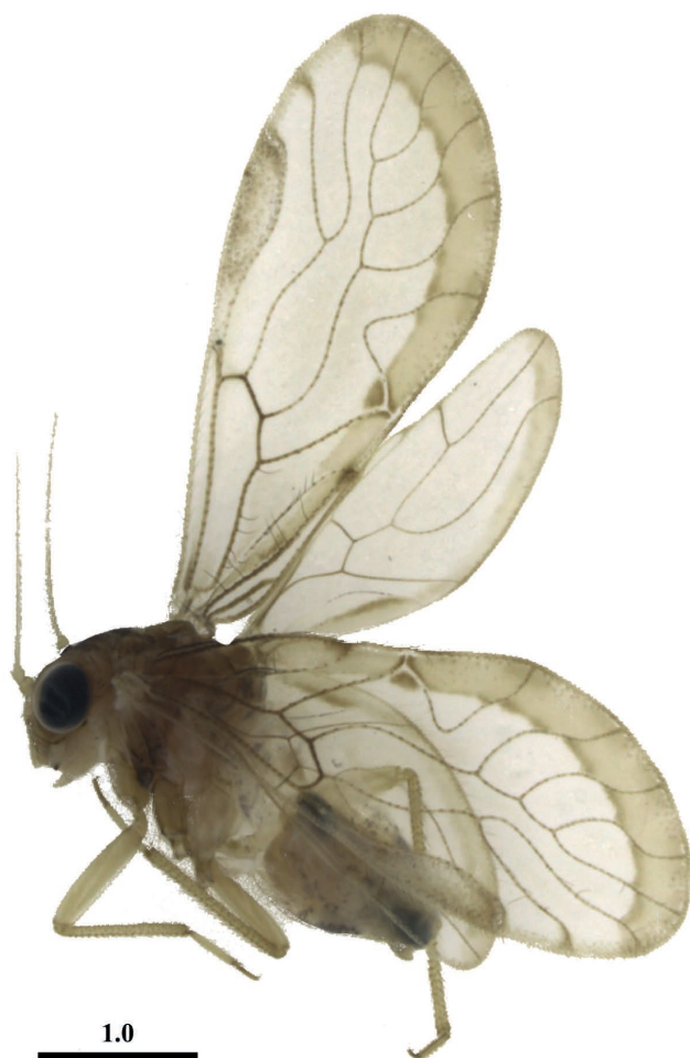
Figure 1. Euplocania atlantica n. sp. (Holotype male). 1. Lateral view. Scale in mm.

The type will be deposited in the Entomological collection Prof. Johann Becker of the Museu de Zoologia da Universidade Estadual de Feira de Santana, in Feira de Santana, Bahia, Brazil (MZFS).