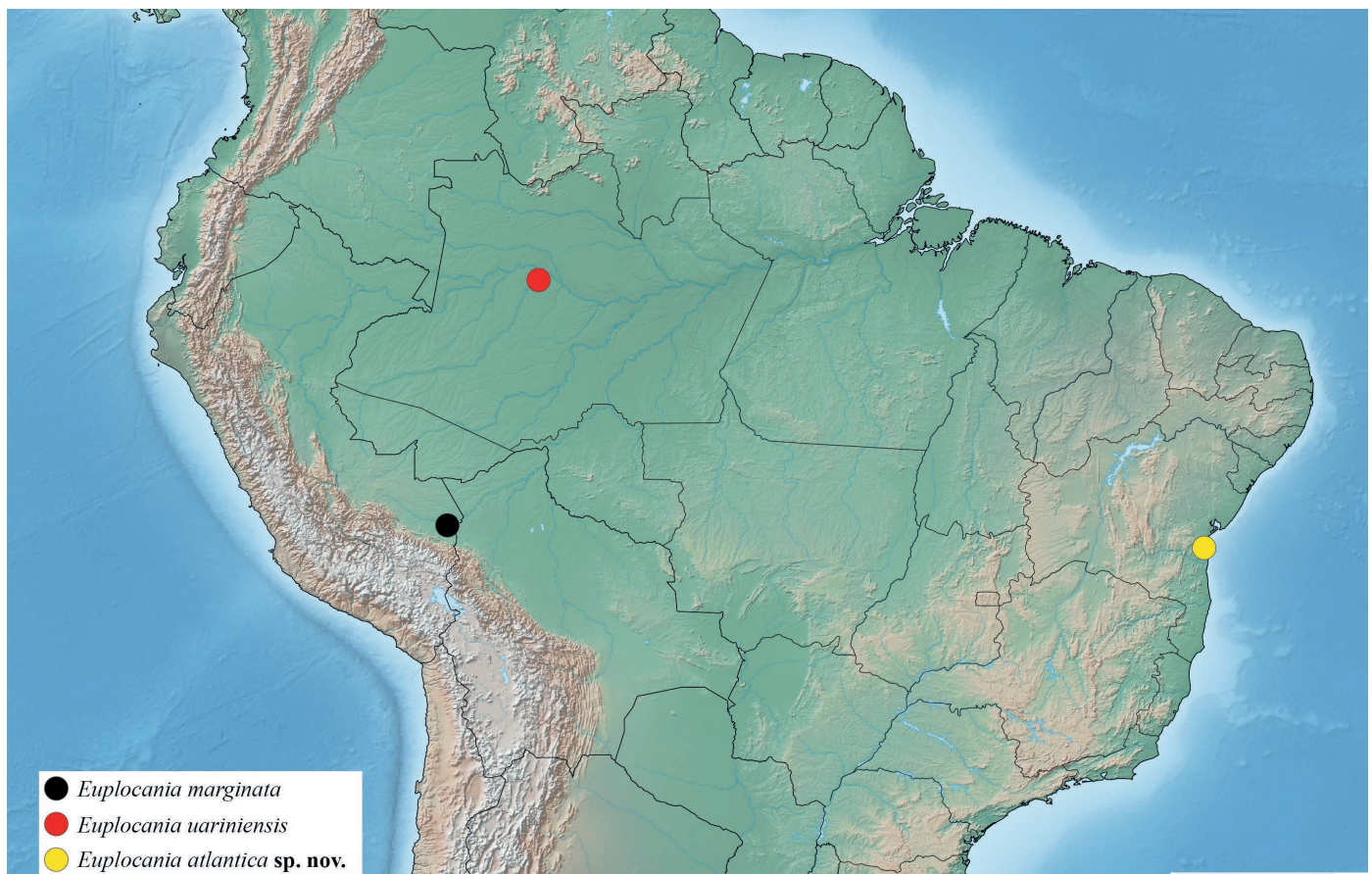
Figure 15. Distribution of the Euplocania species of Marginata group.

occurred. This may explain the high similarity between E. atlantica n. sp. and E. uariniensis as well as the differences that make them distinct species.